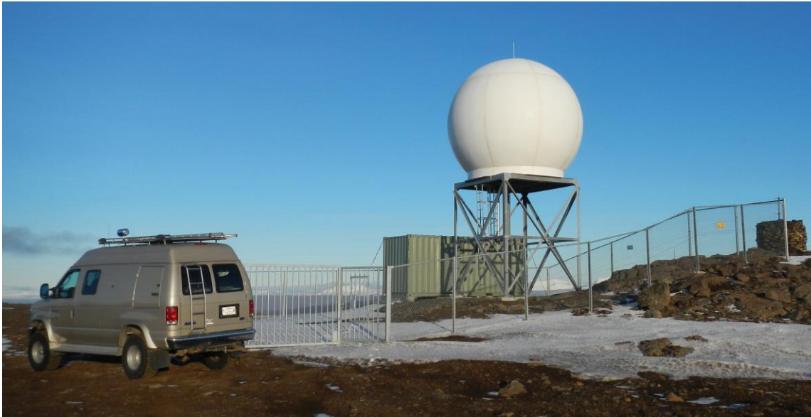
Fljótsdalsheiði E-Iceland C-band radar. Photo Geirfinnur S. Sigurðsson 8 October 2012