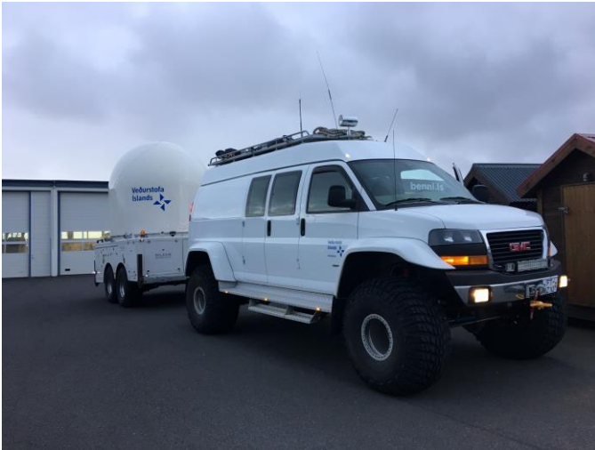
Specially adapted truck to take mobile radar off road. 25 September 2016