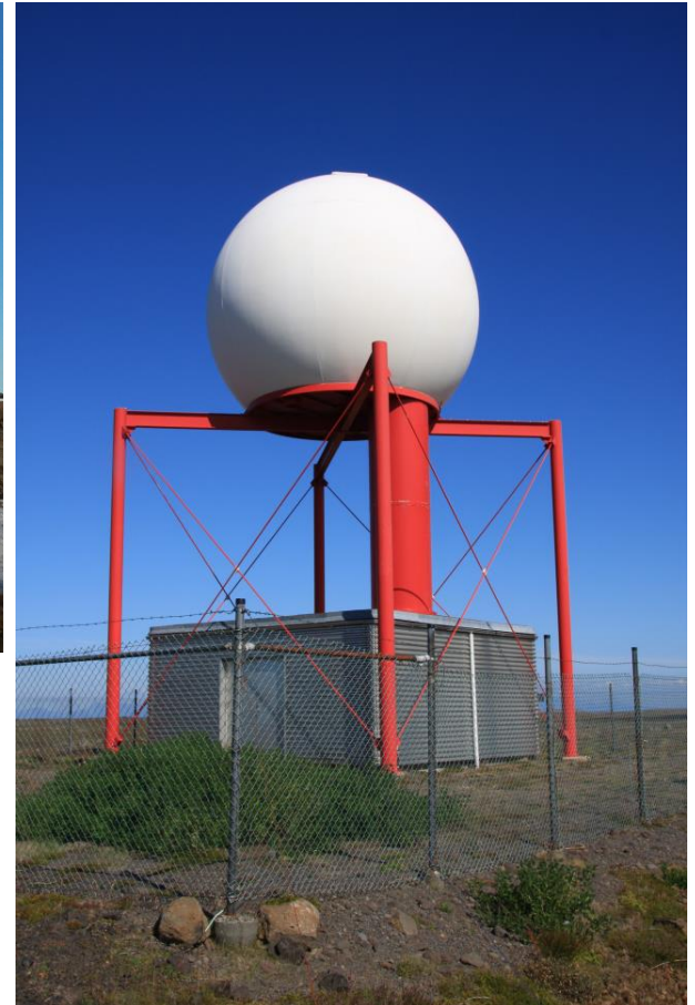
Keflavík SW-Iceland C-band radar. 9 August 2011