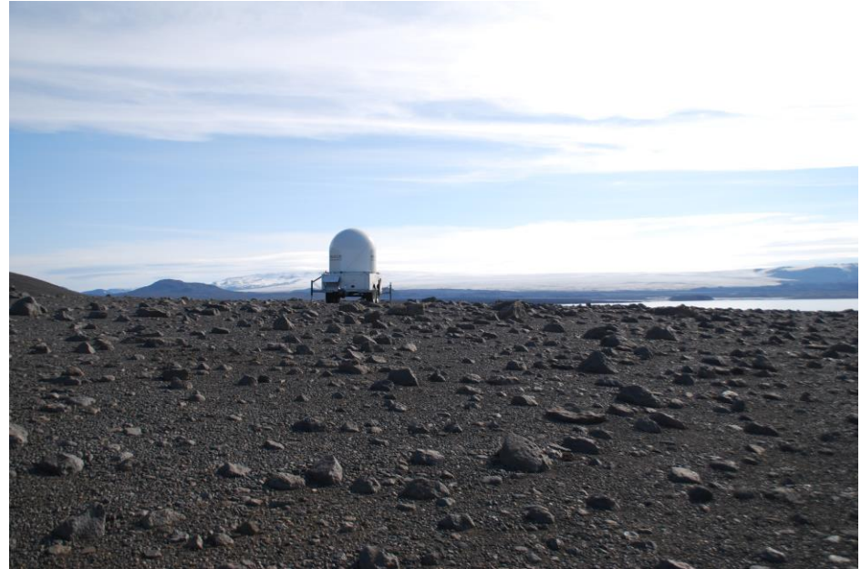
Mobile radar installed with clear view over Bárðarbunga volcano. Photo Þorgils Ingvarsson 22 August 2014