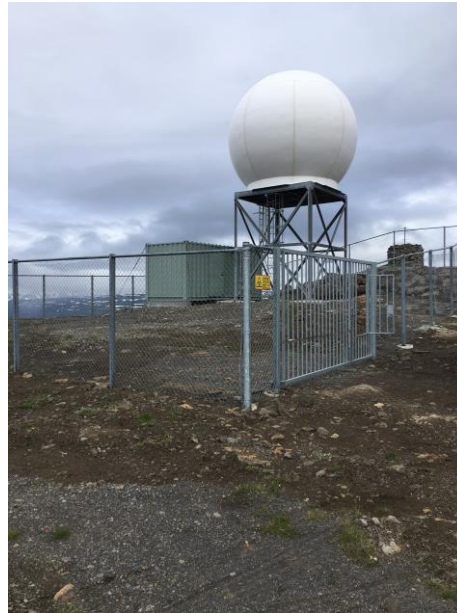
Fljótsdalsheiði E-Iceland EEC C-band radar. 8 July 2016.