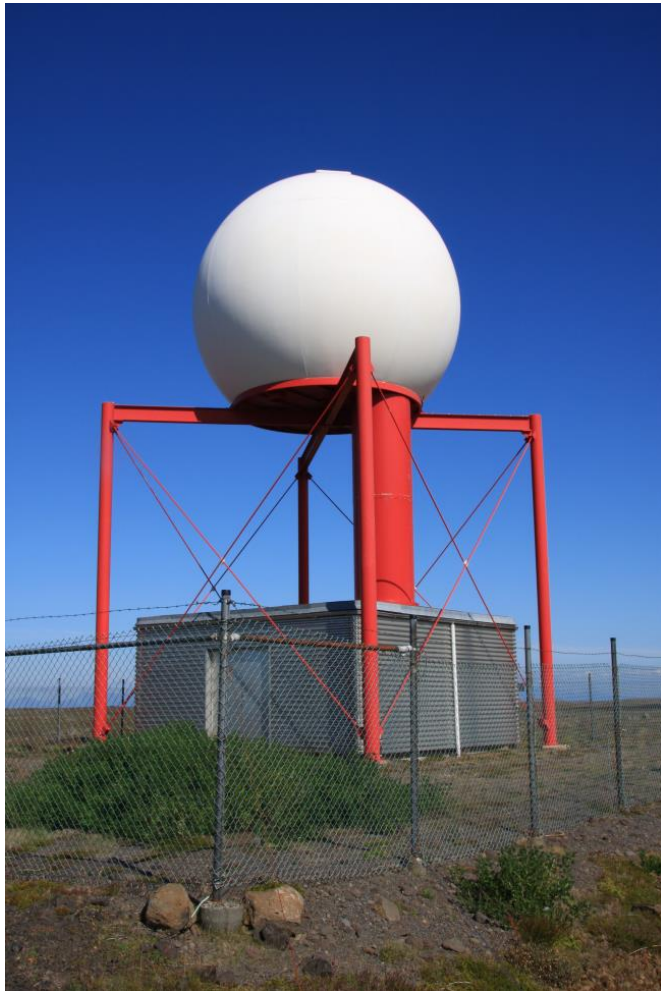
1991 Ericsson Radar