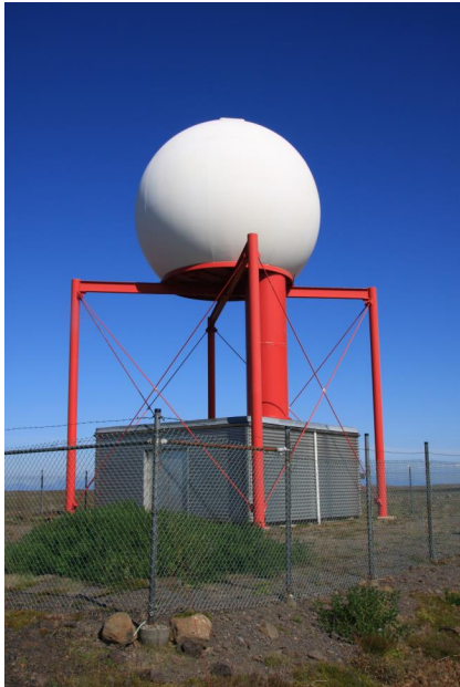
Keflavík SW-Iceland Ericson C-band radar. Photo Þórður Arason 9 August 2011.