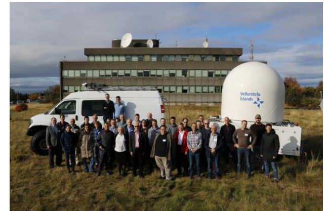
Specially adapted truck to take mobile radar off road. 25 September 2019.