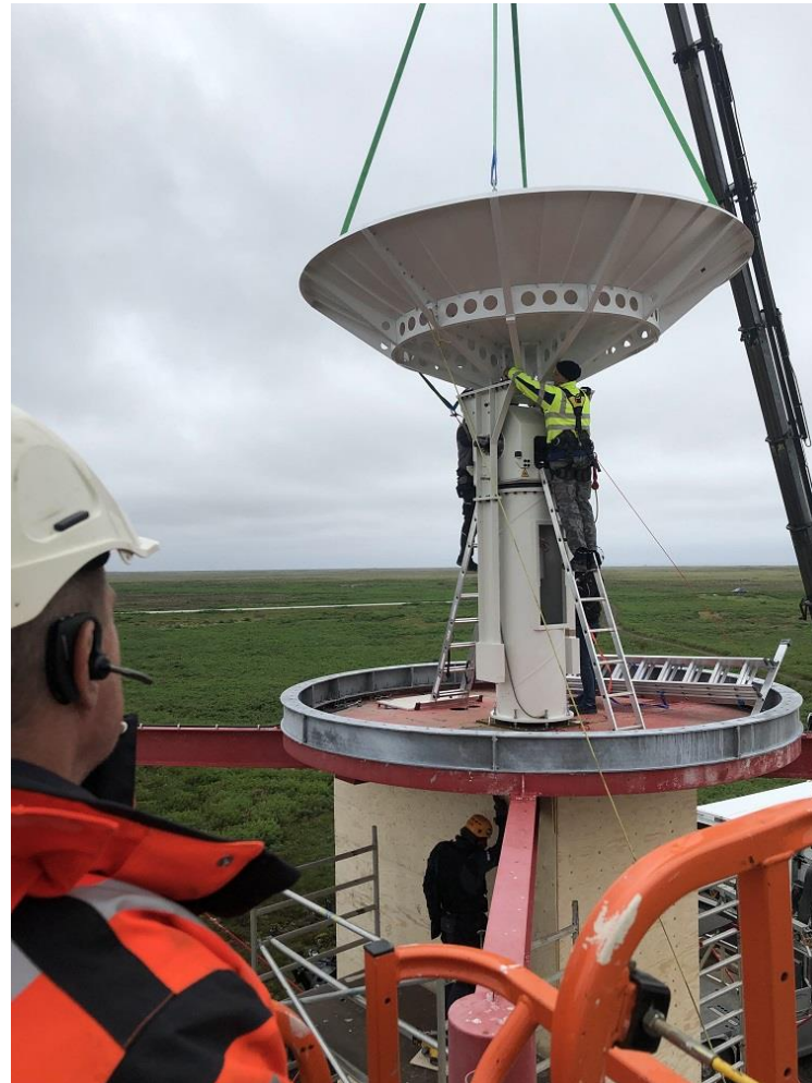
2021 Leonardo Meteor 735CDP10 Radar